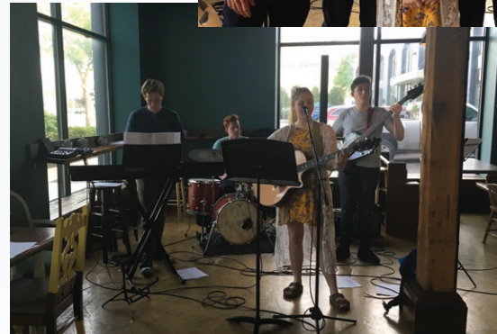
Roots Will Rock Spring Concert