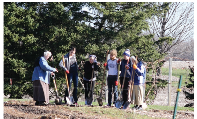
Community Workday Volunteer

Call us to organize a morning or a day for yourself, your colleagues, school group or business. The trails, the water fountain, the gazebo, the gardens, the sounds of meadowlarks, and the smells of the freshly cut hay are waiting for you on the land of the Franciscan Life Process Center, Lowell Campus.