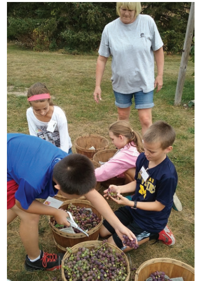
Environmental Education Program

Some of the youngest people to interact with the land are the children who attend the Environmental Education Program each year. Fifth graders from four area Catholic schools visit the Center for a week three times a year. On any given day, you might find them birdwatching, feeding farm animals, or tending the garden. Art class may involve using seeds, grasses, and other items from nature while social studies class incorporates orienteering as a way to learn map skills.