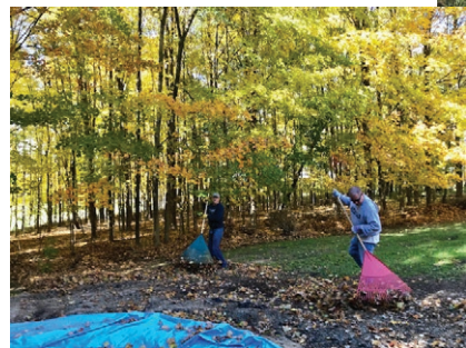
Volunteers help with fall clean up