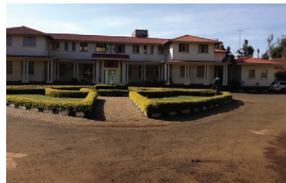
Catholic University of America