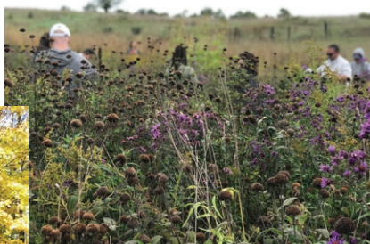
Volunteers gather seeds in prairie