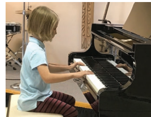
Student in spring recital