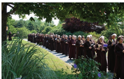
Summer meeting of Franciscan Sisters of the Eucharist