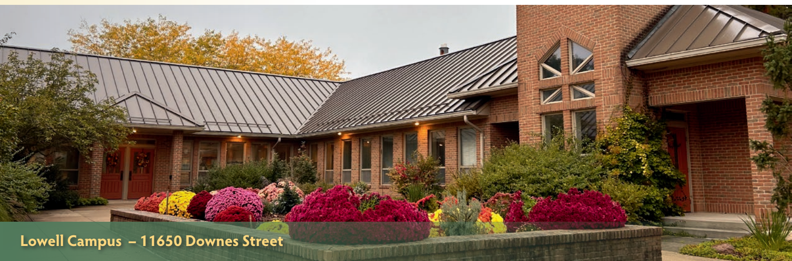
Lowell Campus – 11650 Downes Street