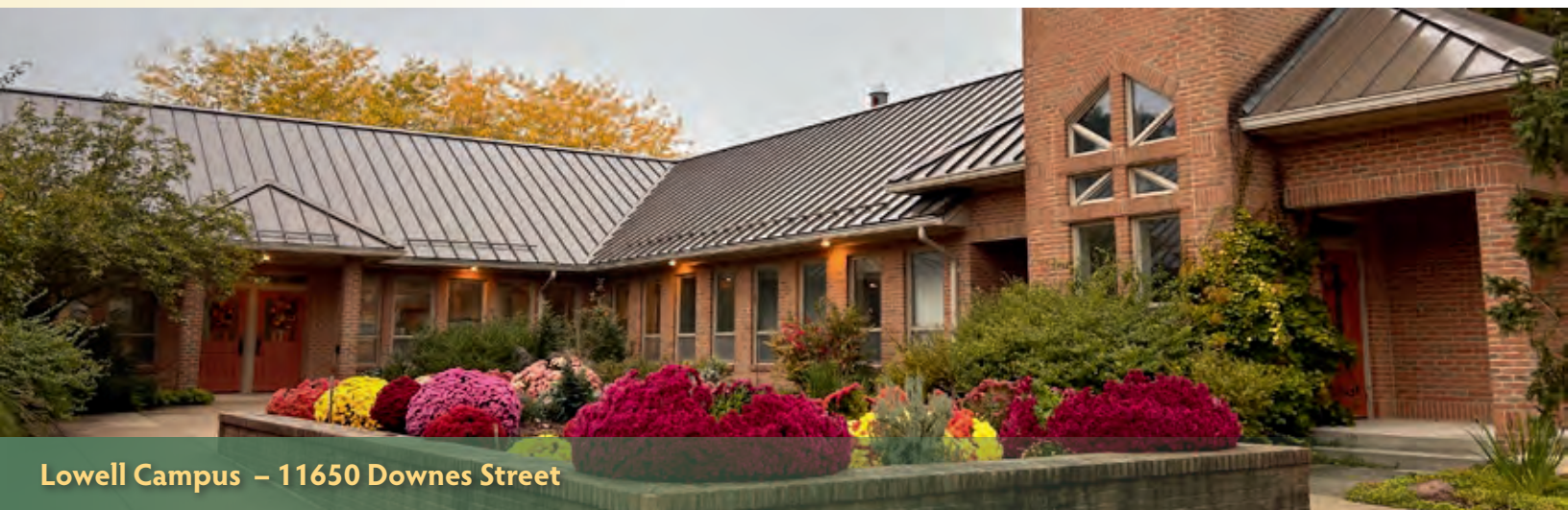
Lowell Campus – 11650 Downes Street