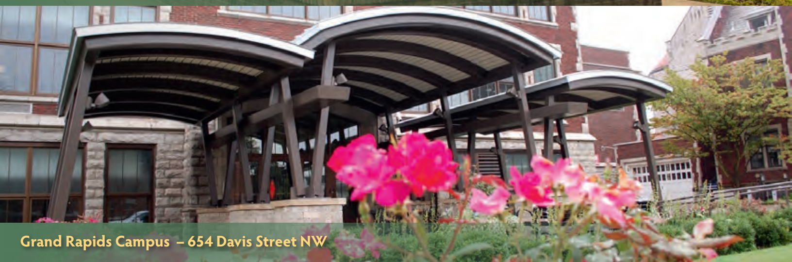
Grand Rapids Campus – 654 Davis Street NW