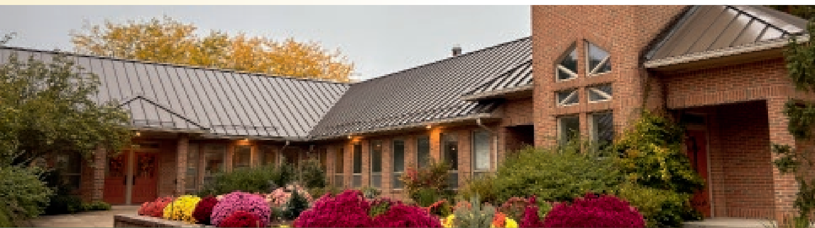
Lowell Campus – 11650 Downes Street