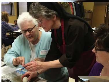
Polish Easter Egg Decorating