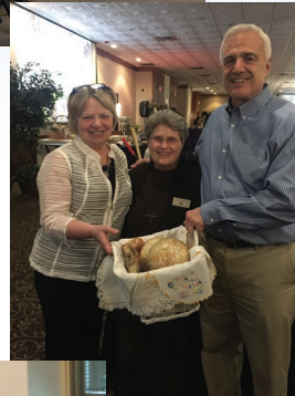
Noto's Charity Winefest 2016