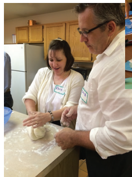
Couples' Bread Baking