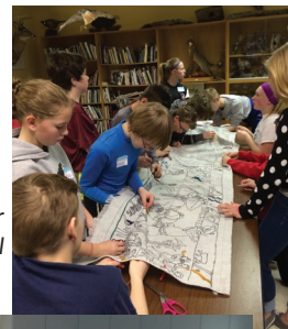
Byron Center Christian School