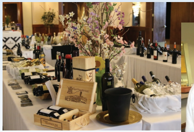
Noto's Charity Winefest 2016