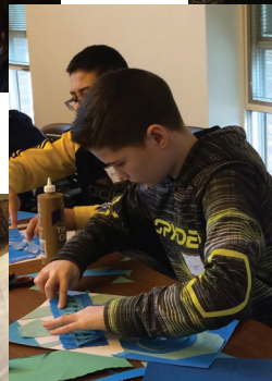
SS Peter and Paul School, Ionia